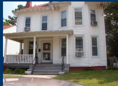
The "Our House" Emergency Family Shelter

Thank you to all our partners and supporters!