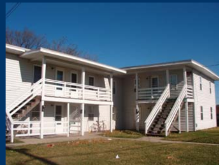
The Reaching Up (RUP) Transitional Shelter